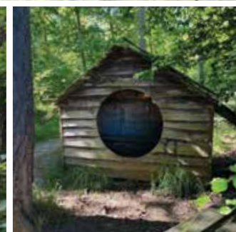
Top: Old school reader statue Below: Kingfisher Bridge; Bird Roost